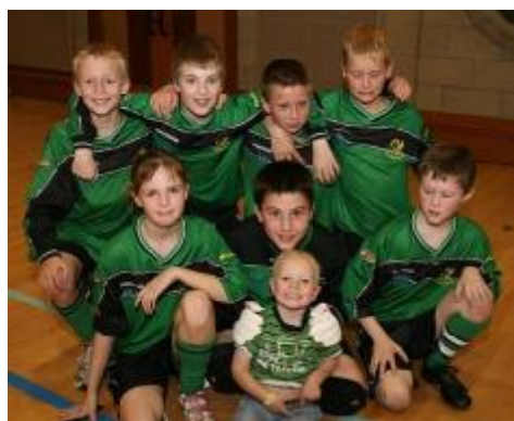
Glaitness United (and mascot!)

The coaches would like to thank all of the players for their hard work at training over the past months and also for their good behaviour at Picky during all competitions.